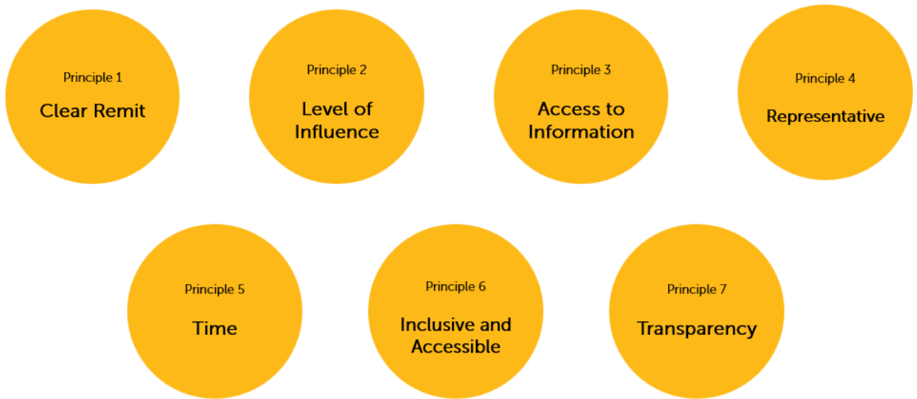
Figure 1. Principles of deliberative engagement

A deliberative Panel, also known as a community panel, may be used to support a deliberative engagement process. A Community panel is a group process where community representatives come together to learn and discuss key themes of the RRLUS and UGS in detail across sessions. The level of promise is always made clear to the panel at the very beginning of the process. This indicates to the panel their level of influence over the final decision or product. This is likely to be set at the Involve-Collaborate level on the IAP2 spectrum, but is subject to further planning between Council and the consultant.