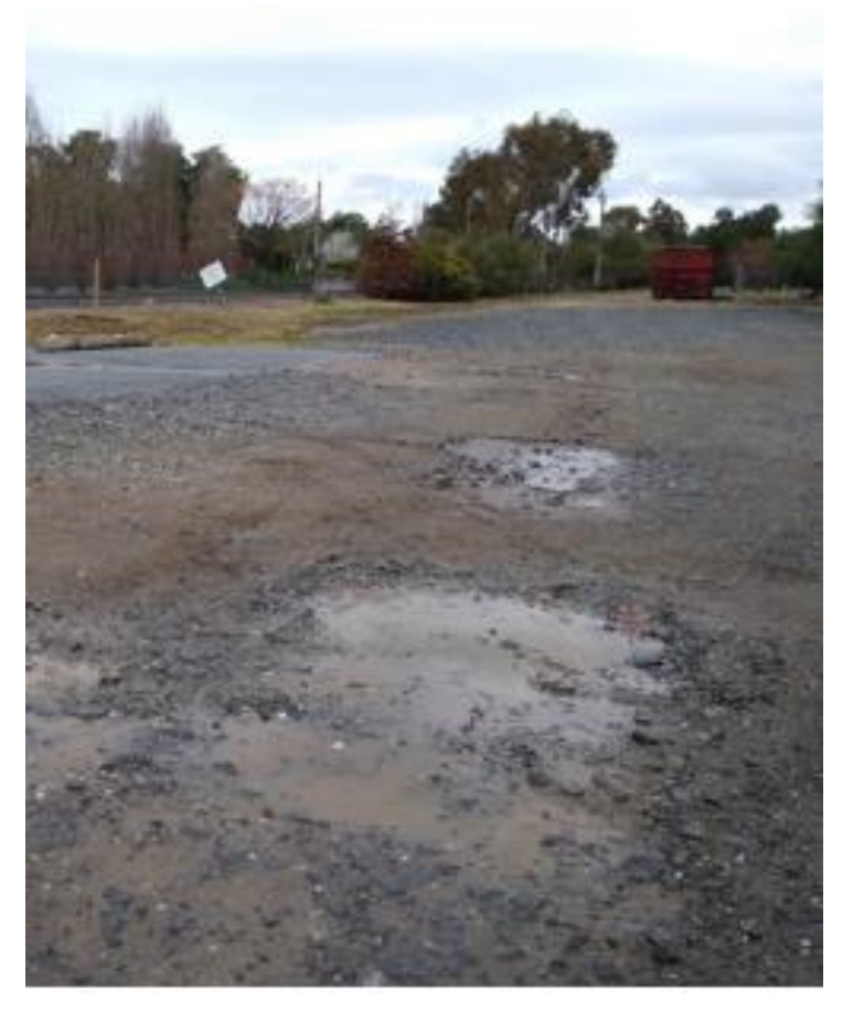
(Car redacted from photo)

4. View of inaccessible access to car parking at Avenel Railway Station car park. There is no safe level pathway to any DDA-compliant car parking at Avenel Railway Station. The car belongs to [redacted]. Members have reported car tyre punctures when using the car park.