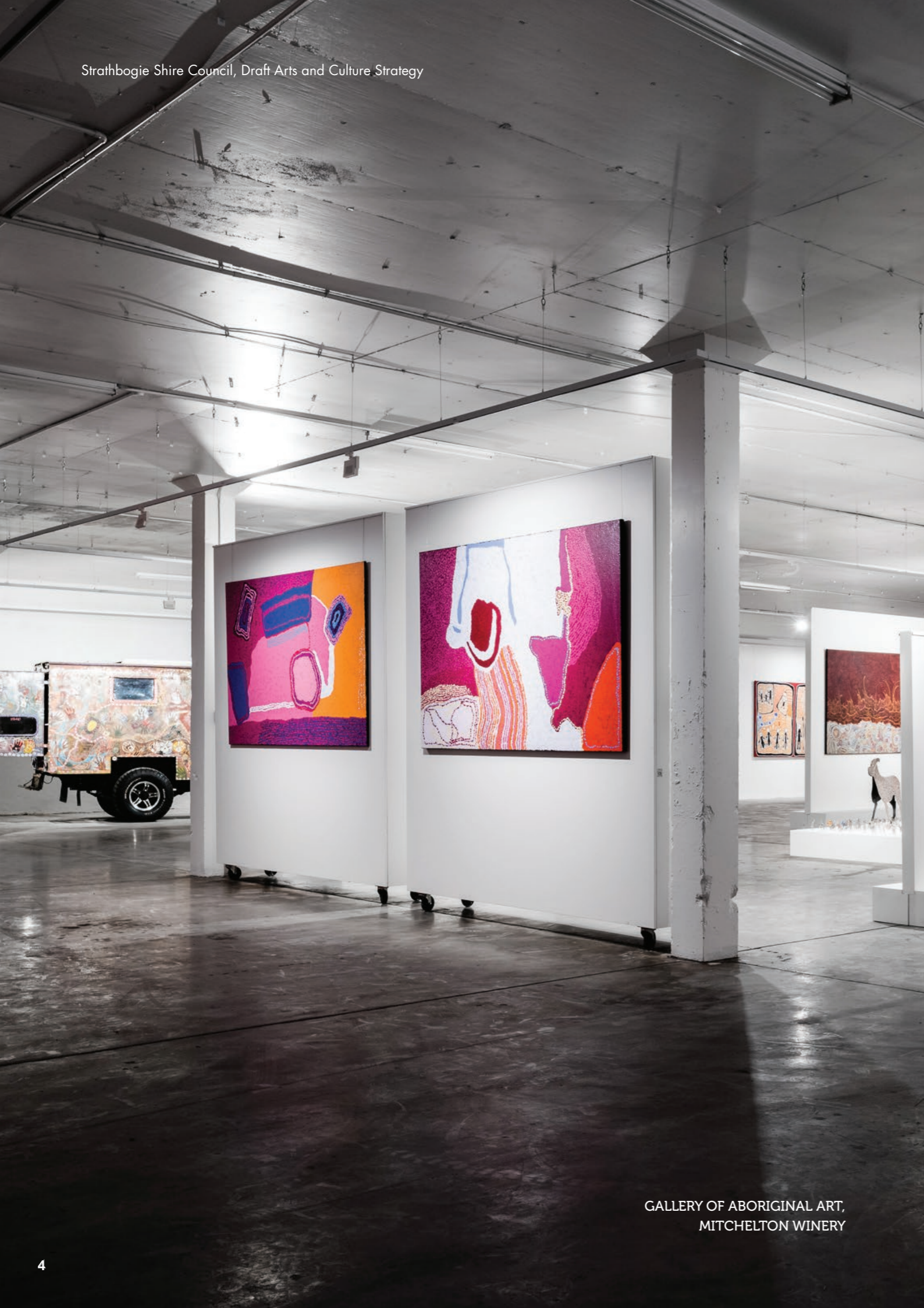
GALLERY OF ABORIGINAL ART, MITCHELTON WINERY