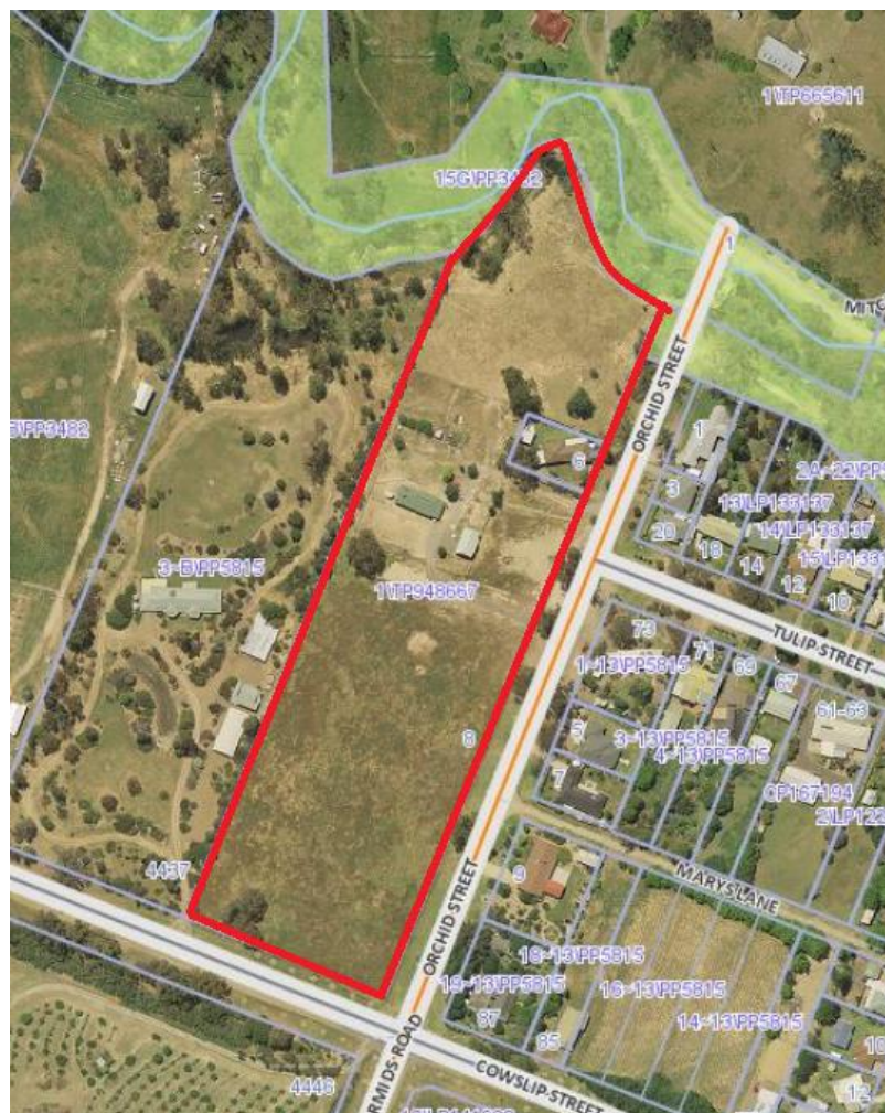
Figure 1 – Subject Site