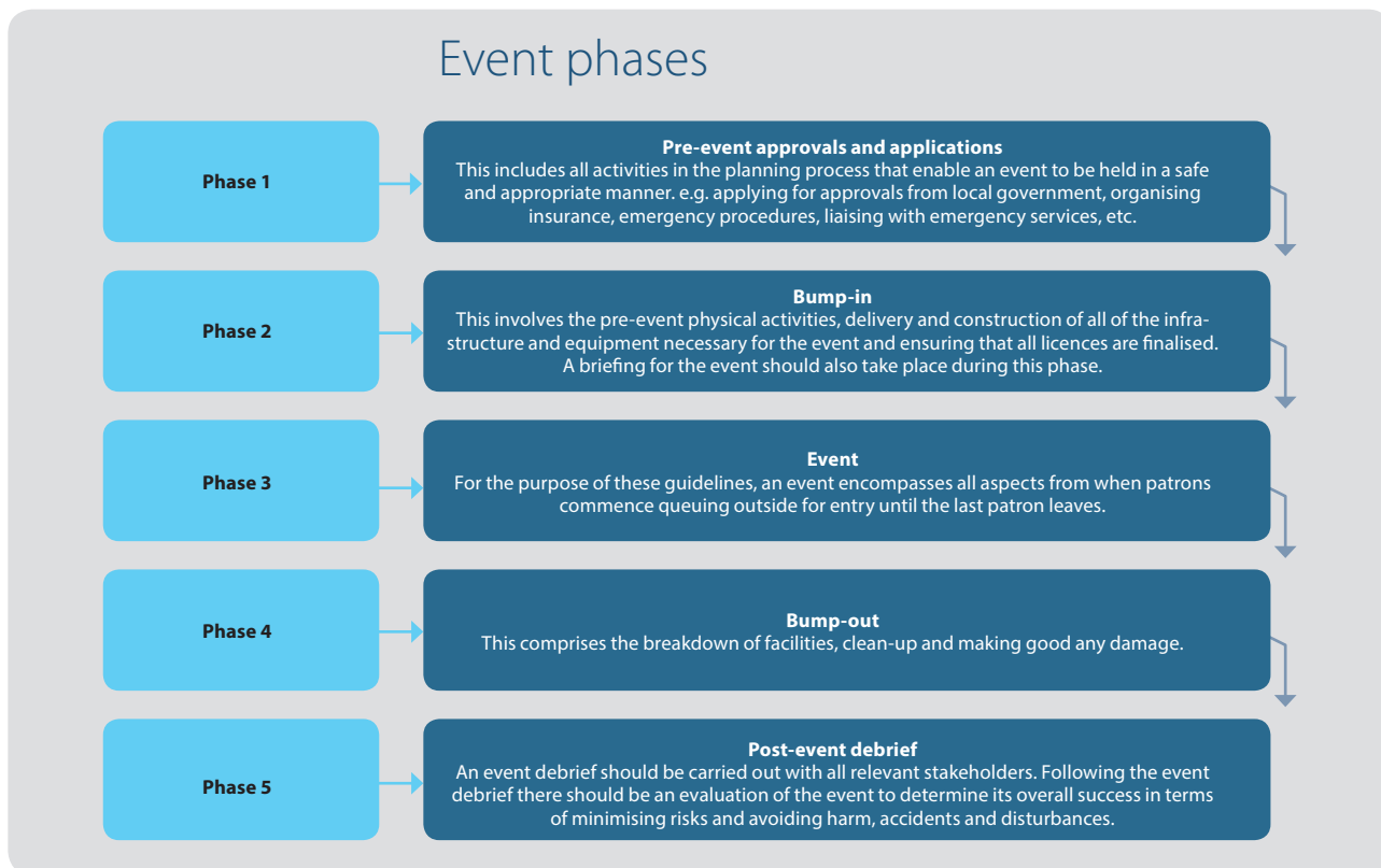
▼ Diagram 1 Five phases of an event

A summary table of key roles and responsibilities during each event phase can be found in Appendix 2 .