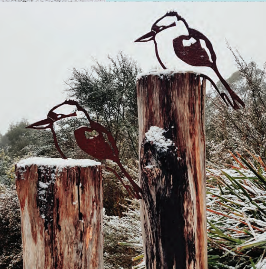
Victoria Tuck captured this image of snow in Strathbogie.