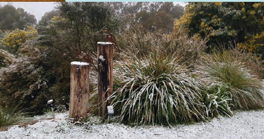
Victoria Tuck captured this image of snow in Strathbogie.