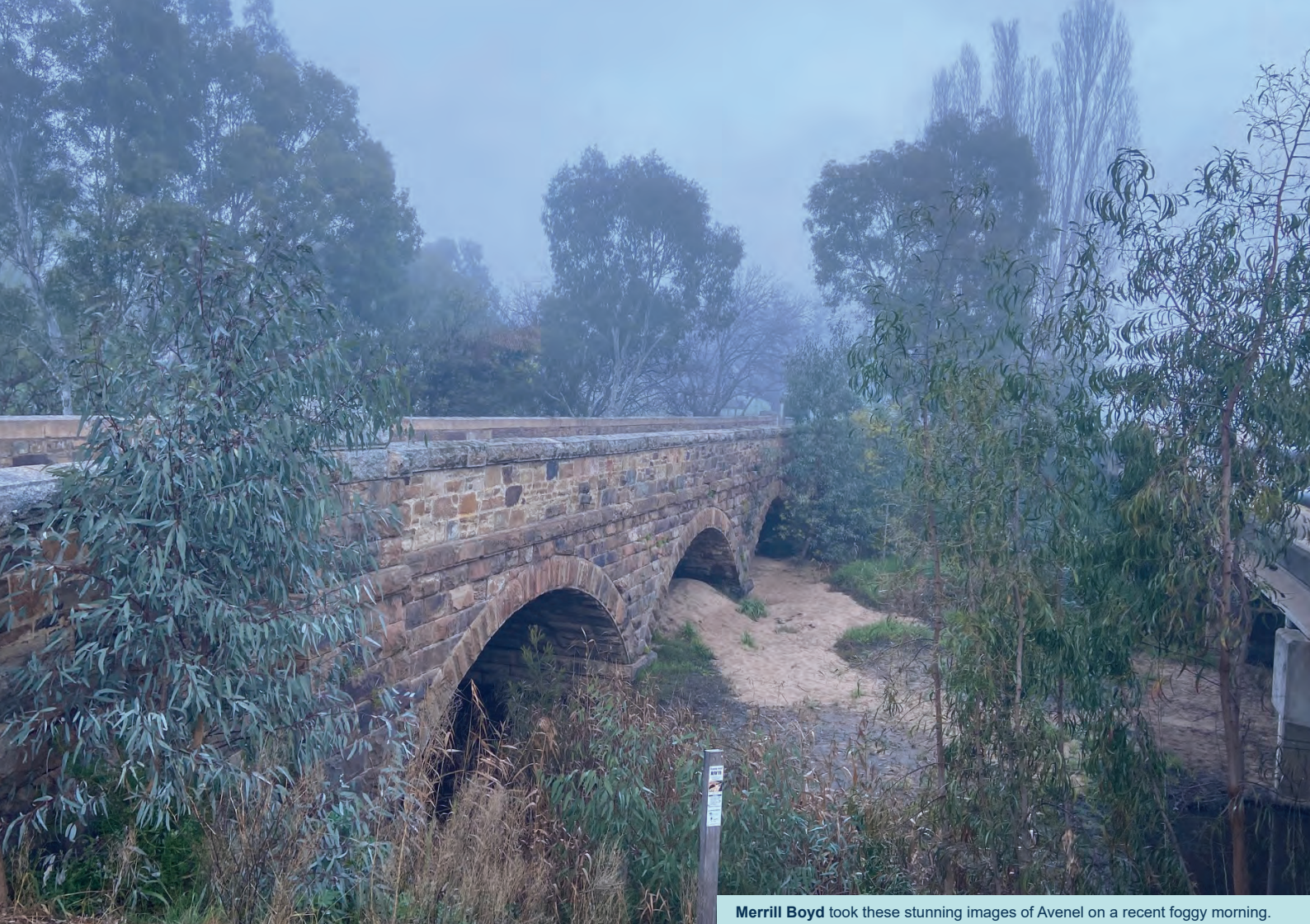
Merrill Boyd took these stunning images of Avenel on a recent foggy morning.